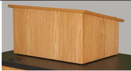
MPL-24 Desktop Lectern.....$800