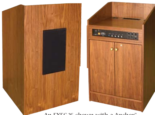
An EXEC-25 shown with a Anchor™ Component Sound system.

We can build in sound systems and make custom fabric or metal speaker grills. We'll work with your equipment or we can supply Amplivox™ or Anchor™ brand equipment.