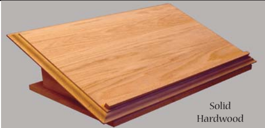
MDSF-24 Open Back Desktop Lecterns.....$400