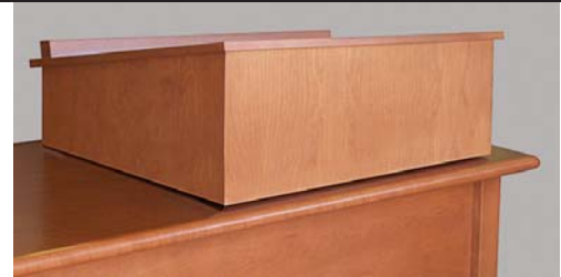
Custom Desktop Lecterns..... Call for pricing