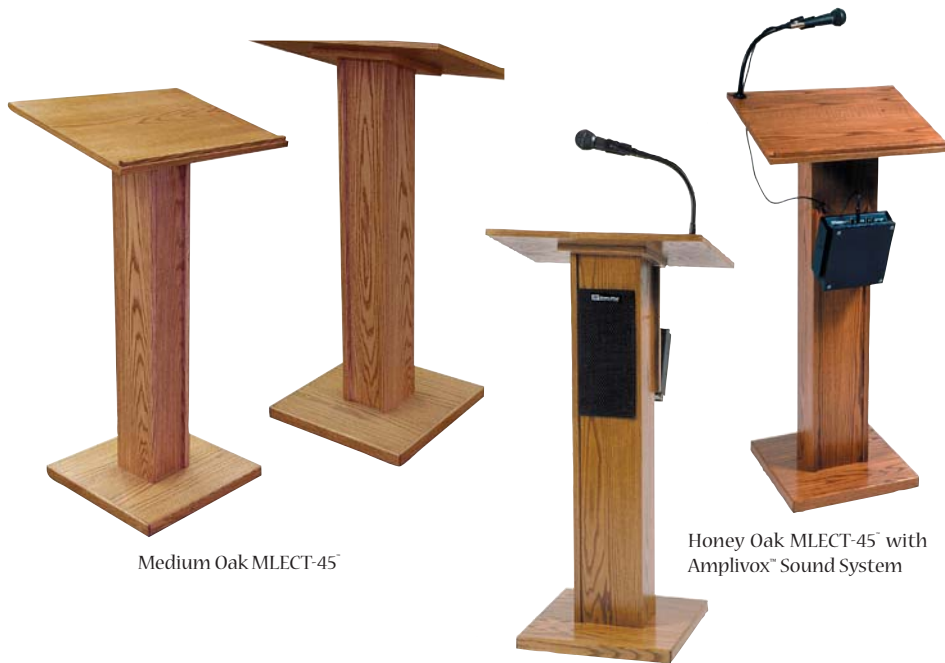
Medium Oak MLECT-45™