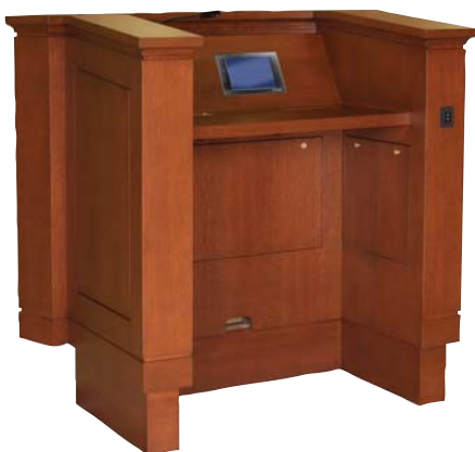
Desk shown in up position

Specifications For This Desk: Model MDCD-45, reference MFI #12202" Wood Species and Cut: White Oak, Quarter Sawn Veneer: AAAA grade, book match, sequenced Finish: Custom stain, #35 sheen, open pore, low VOC precatalyzed lacquer Construction: QS White Oak veneered top, monocoque shell, MDF and plywood substrates. Levelers: Adjustable Options: Height adjust, control panel cutout, halogen light, removable access panel. See other options on page 29.