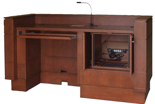
Desk shown in full up position. This desk works well for speakers in a wheelchair and is ADA compliant.

Model MDGR-77, reference MFI #12202™ Wood Species and Cut: White Oak, Quarter Sawn Veneer: AAA/A grade, book match, sequenced Finish: Custom stain, #35 sheen, open pore, low VOC precatalyzed lacquer Construction: Integral lectern top, monocoque shell, MDF and plywood substrates. Casters: hidden 4" carpet, non-marking wheels Options: Height adjust, pullout keyboard, halogen light, removable rack box, removable access panel, locking pocket doors. See other options on page 29.