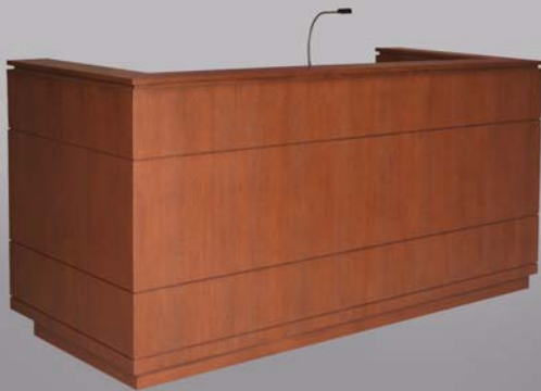
Desk shown in half up position