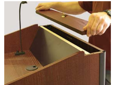
MRTA-TL Top Lock.....$90