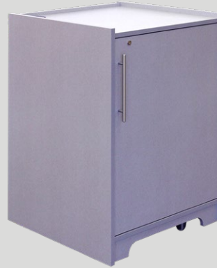
This ELCO-DUO18 is shown in Silver Frost Melamine.