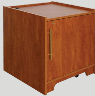
This ELCO-DUO12 is shown in Wild Cherry Melamine.