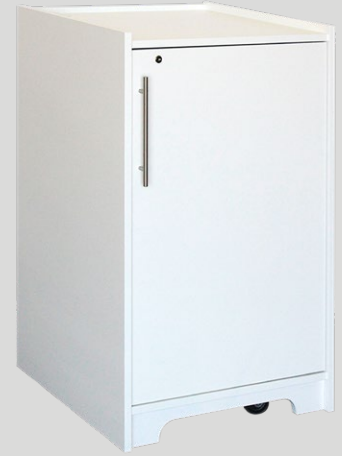
This ELCO-DUO26 is shown in White Melamine.