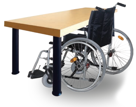
Height Adjustable and Fixed Height Tables Designed for Comfortable Wheelchair Use, See Pages 32-38