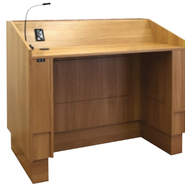
Height Adjustable Desks, See Page 22