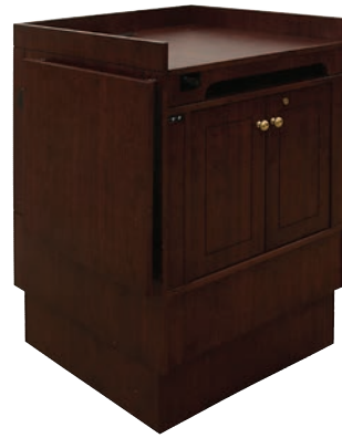
Height Adjustable Workstations, See Page 26