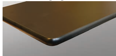
M-TME Per linear foot, T-Mold Edge A T -mold edge adds a durable plastic band around the top. This protects the top surface (vener or laminate). The corners of the top have to be rounded. Available in a wide variety of colors and styles.