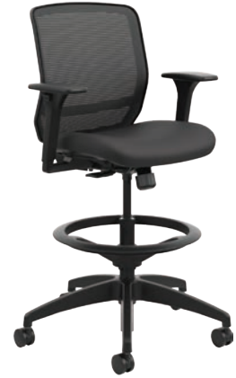
M-TASK-S An adjustable task stool for classrooms, conference/ collaboration rooms, or training rooms. Assembly required on site.