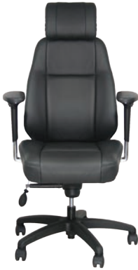
M-LUX-C A high end customizable ergonomic chair for use in 24/7 command centers and luxury board rooms. Ships fully assembled.