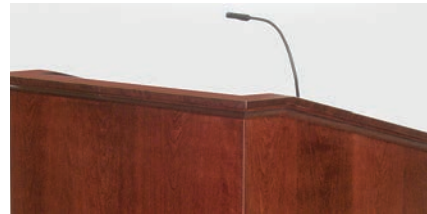
M-CWM Per linear foot, Custom Wood Molding Solid wood molding can be added to serve as a handrail or as decorative trim. Other styles are available at an additional cost.