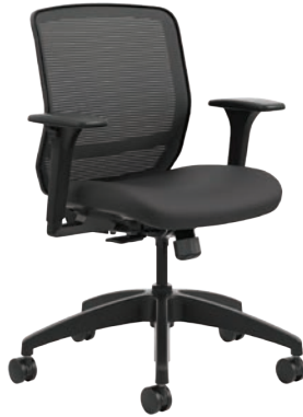
M-TASK-C An adjustable task chair for classrooms, conference/ collaboration rooms, or training rooms. Assembly required on site.