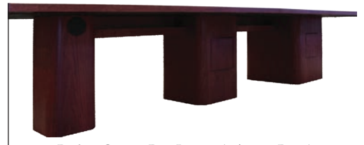
Radius Corner Box Leg with Access Panels