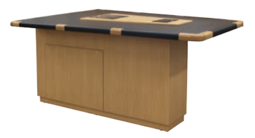
Tapered Credenza Base with Access Panel