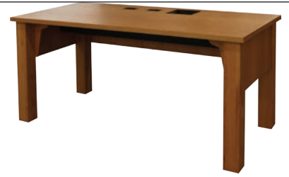
Wood Straight Leg