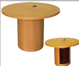
Barrel Leg with Access Panel