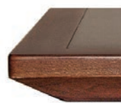
Reverse Bevel Edge