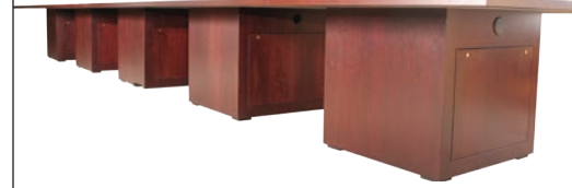
Cabinet Box Legs with Access Panels