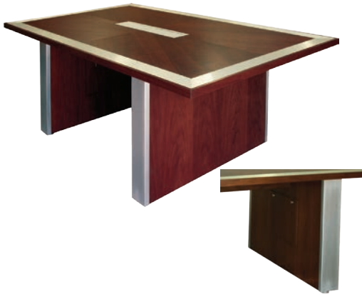
Metal End Cap on Skinny Box Leg with Access Panel