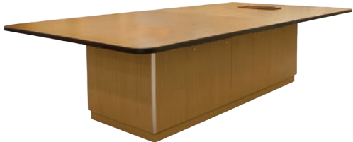
Credenza Base with Aluminum Corners and Access Panel