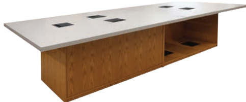
Credenza Base with Access Panel