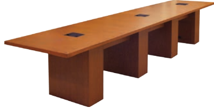
Skinny Box Leg with Access Panels