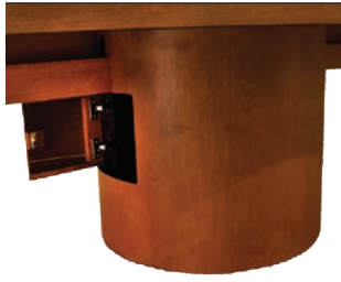
Barrel Leg with Hinged Access Door