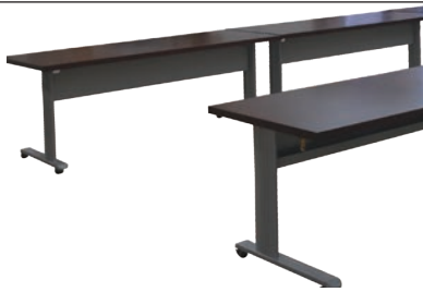
Metal C-Legs with Modesty Panel